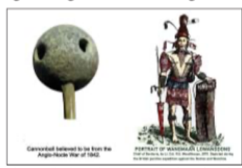
Portrait of Wangmaan Lowangdong, a freedom fighter who led his people during the Anglo-Nocte War of 1842.

The war began on 25 November, 1842, when Cap-